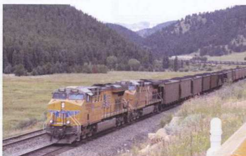
A coal train that has just come through the Moffat Tunnel heads east through Rollinsville on its way to Boulder.