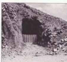
Needle's Eye Tunnel, East Portal